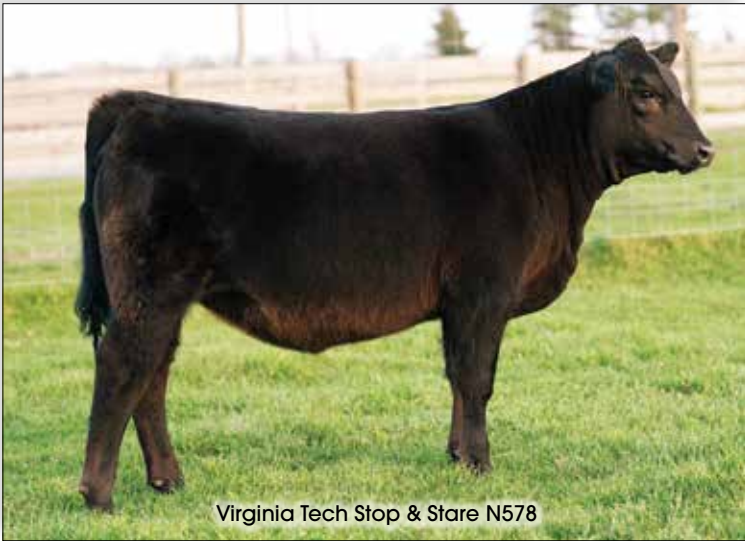
Virginia Tech Stop & Stare N578