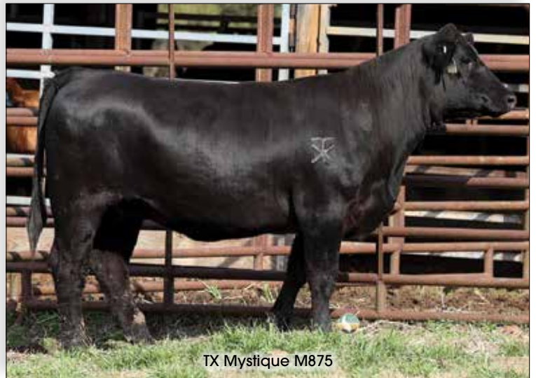
TX Mystique M875