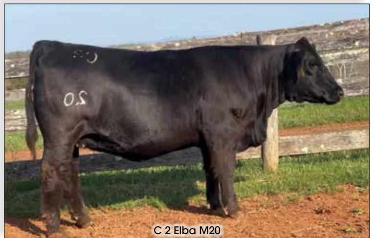
C 2 Elba M20

Consignor C SQUARED CATTLE CO TOMMY CLARK 540.229.9949