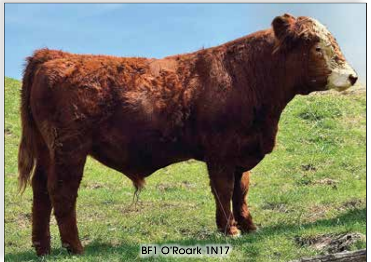
BF1 O`Roark 1N17

Consignor BARLOW FARMS MIRANDA ULMER 570.899.0772