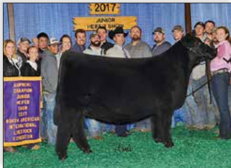
JSUL Who Dat Raptor - reference