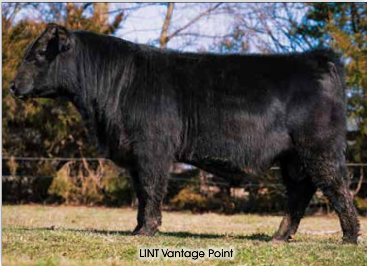
LINT Vantage Point

Consignor KENNE AG ENTERPRISES 540.247.8358