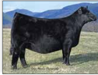
S&S Hend Ariel 4069M - reference