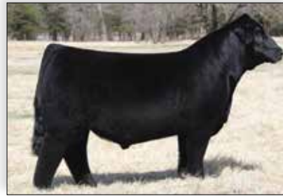
R/C SFI Creedence 417J - reference