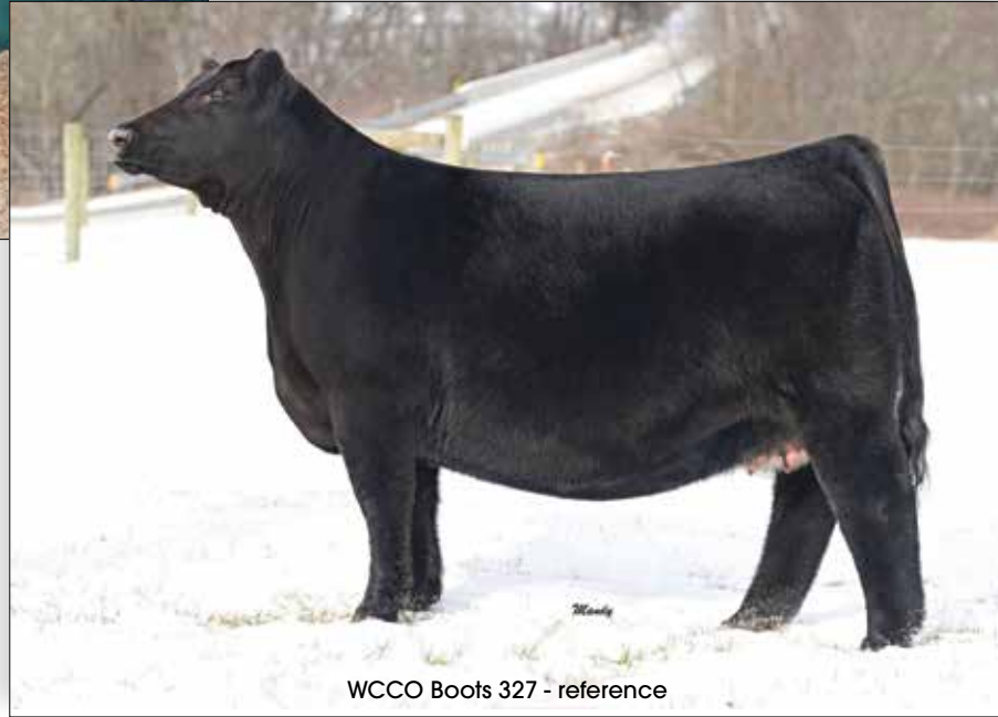
WCCO Boots 327 - reference