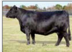
Bramlets Beautiful Z223 - dam of M14 and M15

Consignor CODE CATTLE COMPANY 304.671.9112