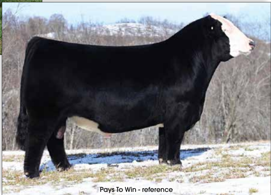
Pays To Win - reference