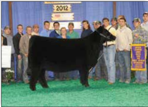
JSUL Who Dat 1602 - reference