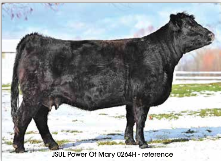
JSUL Power Of Mary 0264H - reference