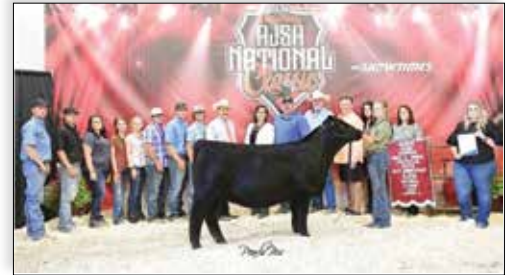
BTYL Nocona 215G - reference