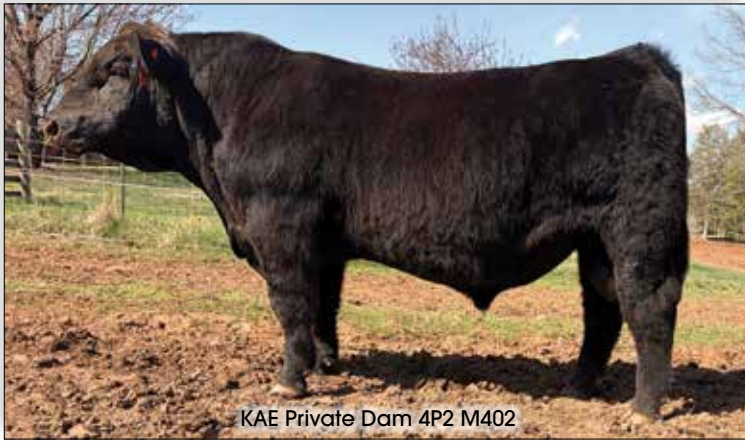
KAE Private Dam 4P2 M402