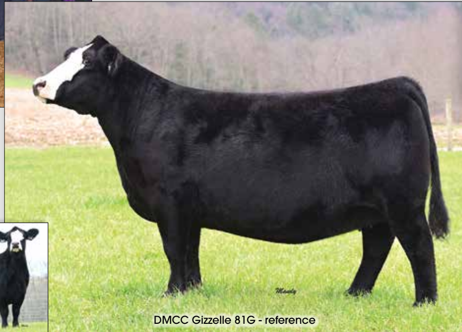
DMCC Gizzelle 81G - reference