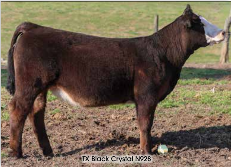
TX Black Crystal N928

Consignor VIRGINIA TECH CHAD JOINES 540.557.7263