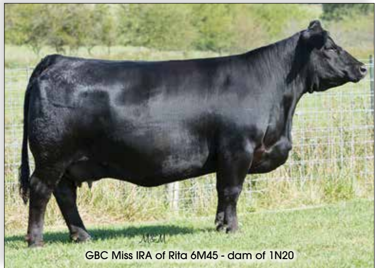
GBC Miss IRA of Rita 6M45 - dam of 1N20