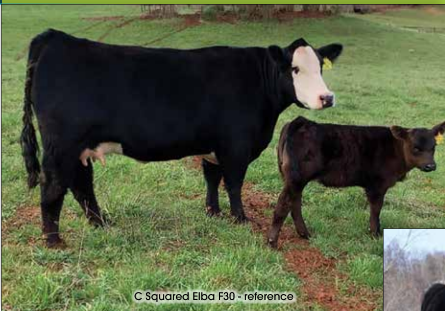
C Squared Elba F30 - reference