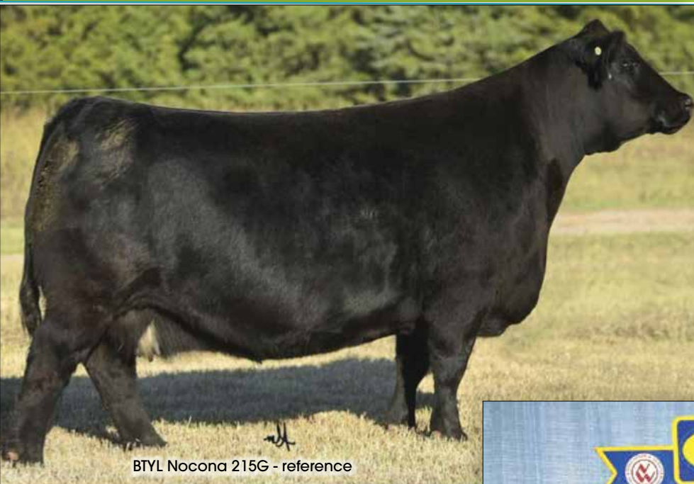
BTYL Nocona 215G - reference