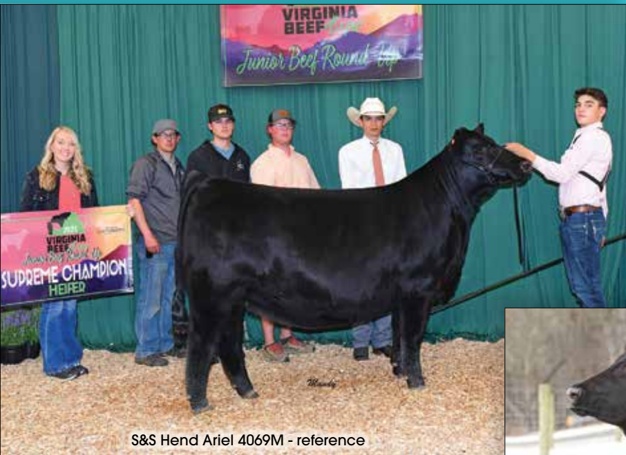
S&S Hend Ariel 4069M - reference