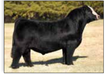
TL On The Run 106K - reference