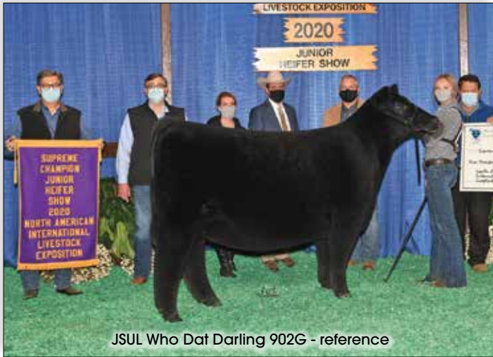
JSUL Who Dat Darling 902G - reference