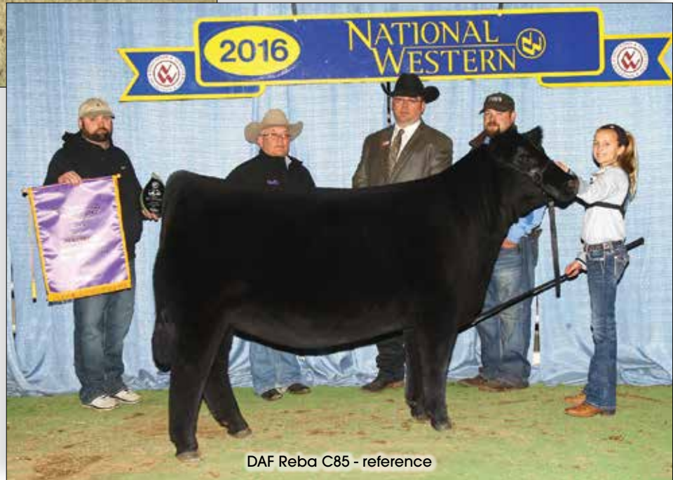
DAF Reba C85 - reference