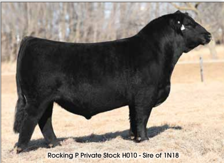
Rocking P Private Stock H010 - Sire of 1N18

Consignor TX ENTERPRISES CHARLIE THOMAS 336.575.5461