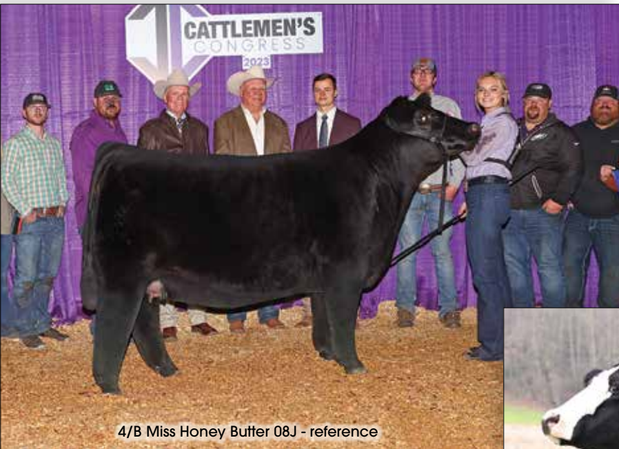
4/B Miss Honey Butter 08J - reference